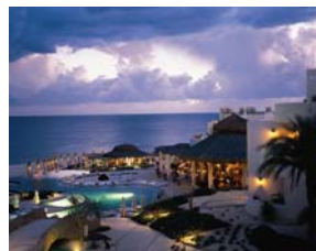
Las Ventanas, A Rosewood Resort – San Jose Del Cabo, Mexico