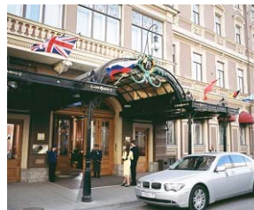
Grand Hotel Europe, An Orient Express Hotel – St. Petersburg, Russia