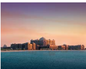
Emirates Palace, A Kempinski Hotel – Abu Dhabi