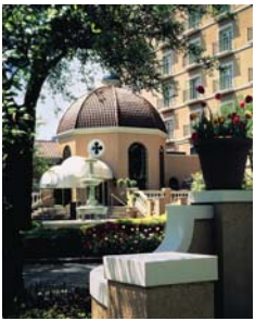
The Mansion on Turtle Creek, A Rosewood Hotel – Dallas, Texas USA

This listing illustrates the types of world class properties we partner with through our amenity program.