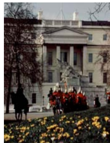
The Lanesborough, A St. Regis Hotel – London, England