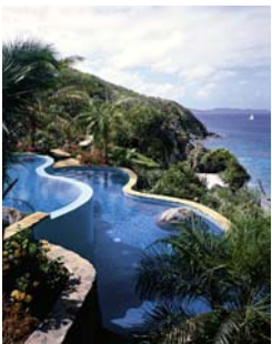
Little Dix Bay, A Rosewood Resort – BVI