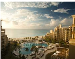
The Ritz-Carlton – Cayman Islands