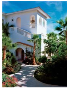
One&Only Palmilla – Los Cabos, Mexico